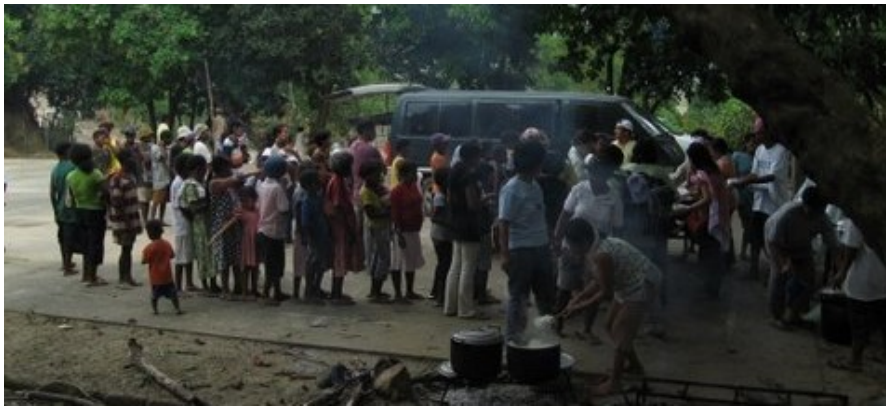
More pictures from the Medical Mission and the Moringa Feeding Program