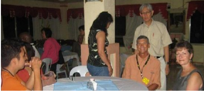
The Moringa Feeding Program fed about 150 families of "aetas", "unats"