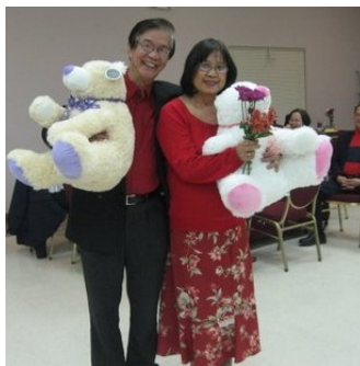
Mr. Valentines and Ms Valentines show off their prizes.

Valentines diners enjoyed a menu of Salad, BBQ Pork, Salmon, grilled Vegetables, Dessert and Wine. Followed by dancing.