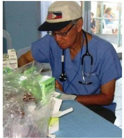
In “just 5 days” the Bogo City Medical Mission treated 2,179 patients.